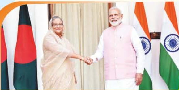
STATE VISIT OF PRIME MINISTER OF BANGLADESH TO INDIA