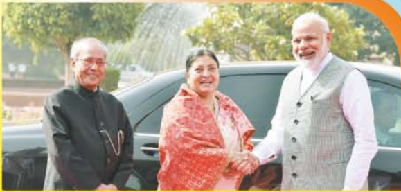
STATE VISIT OF PRESIDENT OF NEPAL TO INDIA