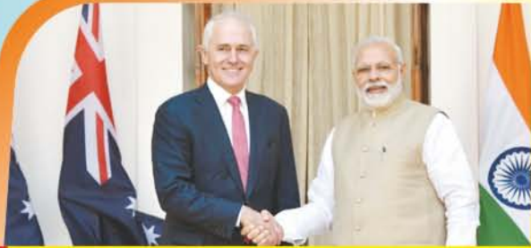
STATE VISIT OF PRIME MINISTER OF AUSTRALIA TO INDIA