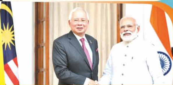
STATE VISIT OF PRIME MINISTER OF MALAYSIA TO INDIA